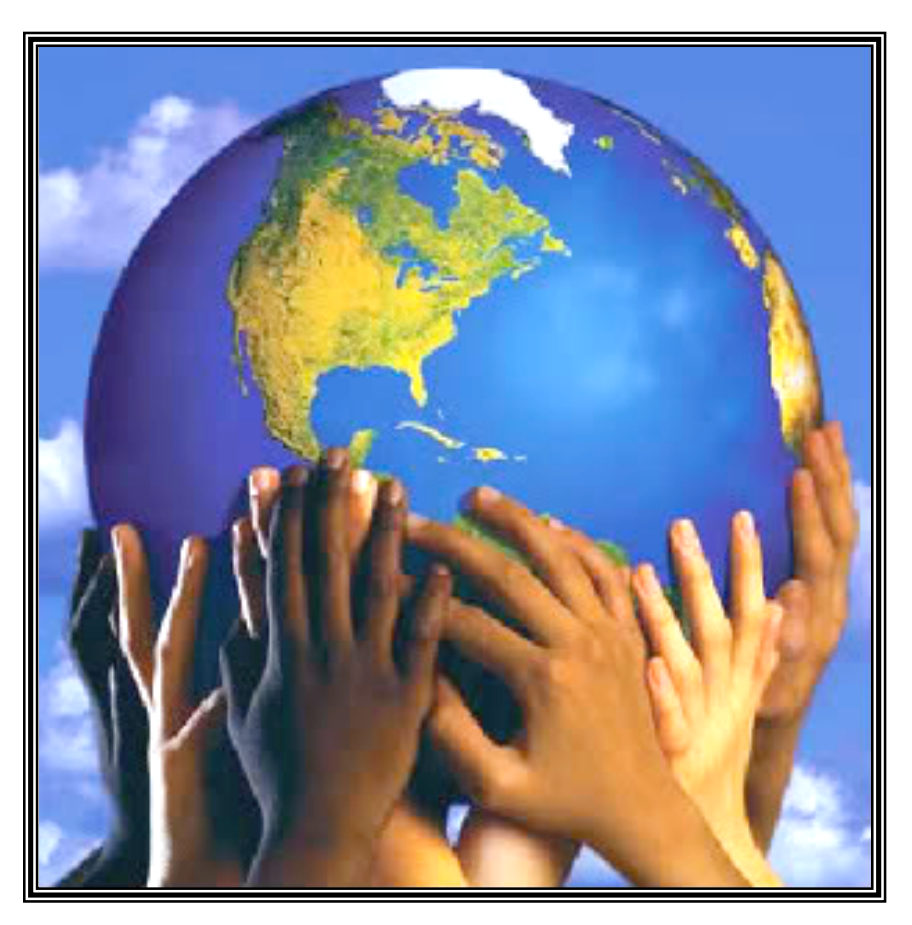
"Wealth Distribution" by Yanaar, sourced from Photobucket, Equality Pictures & Paintings Album.